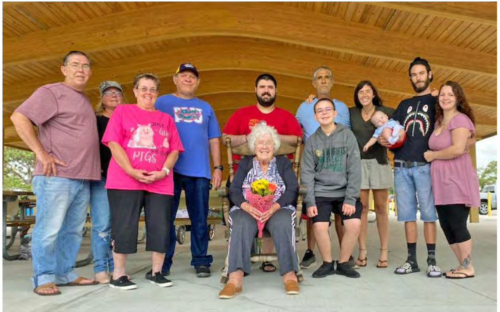
ABOVE: Four generations of the Conway family gather together for a celebration.

• VISIT OR VOLUNTEER AT A RETIREMENT HOME Residents love visitors. The smile of a child or young adult can change their world.