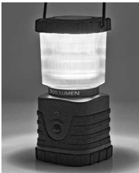
Battery powered lanterns are safer than candles.