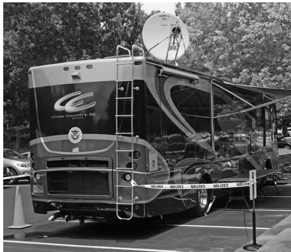
ABOVE: Mobile Disaster Recovery Center vehicle is on display in front of the FEMA/State Joint Field Office in Tallahassee.